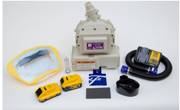
Ford® Limited-Use Public Health Emergency PAPR Kit

Limited-Use Public Health Emergency PAPR vs. 3M™ Versaflo™ TR-300+ PAPR